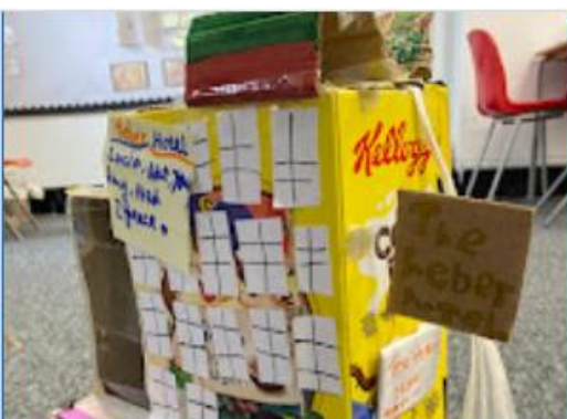
The Heber Hotel

Our students considered how physical spaces (home, health, education, sport, entertainment, commercial) can provide better experiences for everyone and how they might play a part in the inclusive, digitally connected, and environmentally friendly city of the future.