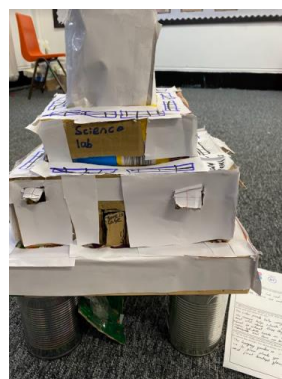
Sparks Science Lab