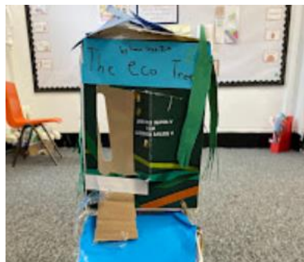
The Eco Tree